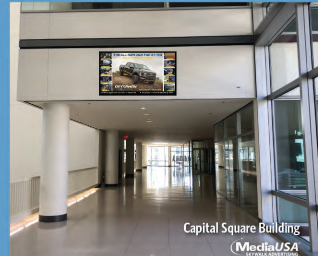
Capital Square Building