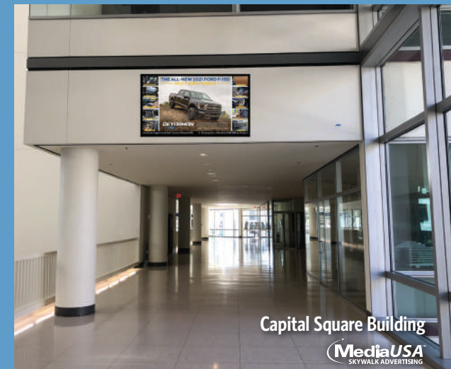
Capital Square Building