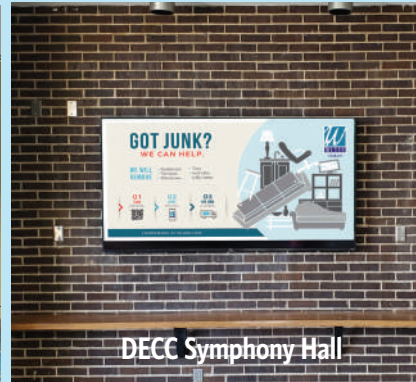
DECC Symphony Hall