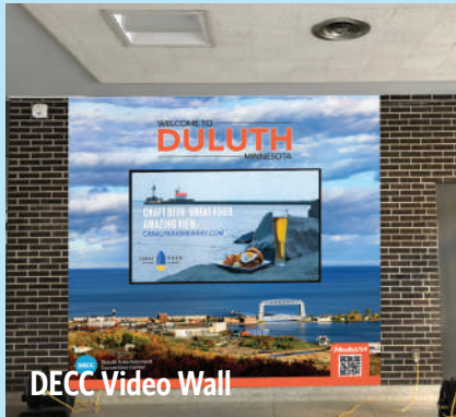
DECC Video Wall

Get YOUR digital campaign started today!